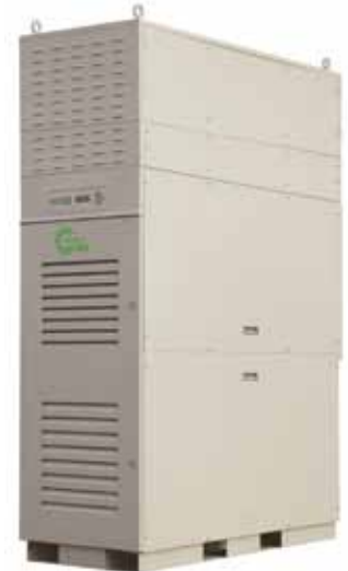
C65 CARB ICHP MicroTurbine