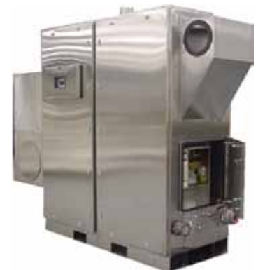
Offshore Hazardous Area