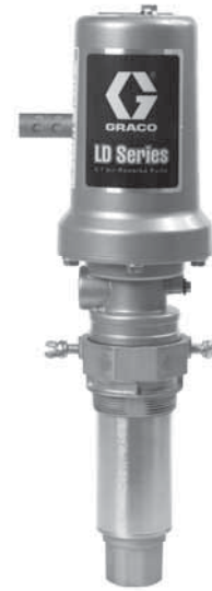
LD Series 5:1 Pump