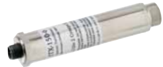
ITX-150-6 Smart Coil™

Remote Mount Coil Primary Resistance: 3.1 – 3.8 ohms Secondary Resistance: 10.9 – 13.4k ohms CSA Approved Duration: 400-500 uS