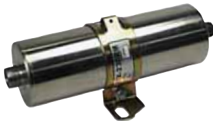
ITX-230RM Smart Coil™

Open Coil, Non-Hazardous Primary Resistance: 3.1 – 3.8 ohms Secondary Resistance: 10.9 – 13.4k ohms Duration: 400-500 uS