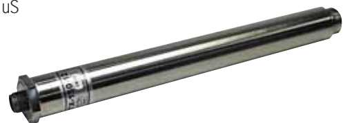
ITX-150-12 Smart Coil™

Integral Coil Primary Resistance: 0.83 – 1.02 ohms Secondary Resistance: 6.2 – 7.6k ohms Max Output: 45kv Duration: 400-500 uS