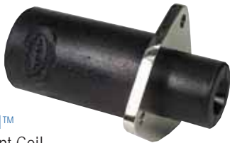
IT-230FM Smart Coil™

Open Coil, Non-Hazardous Primary Resistance: 0.83 – 1.02 ohms Secondary Resistance: 6.2 – 7.6k ohms Max. Output: 45kV Duration: 400-500 uS