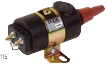
IT-230 Smart Coil™

Flange Mount Coil Primary Resistance: 3.1 – 3.8 ohms Secondary Resistance: 10.9 – 13.4k ohms Duration: 400-500 uS