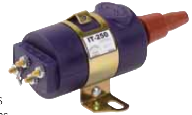
IT-250 Smart Coil™

Flange Mount Coil Primary Resistance: 0.83 – 1.02 ohms Secondary Resistance: 6.2 – 7.6k ohms Max. Output: 45kV Duration: 400-500 uS