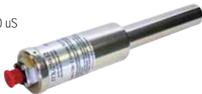
ITX-250-12 Smart Coil™

6 in. Integral Coil Primary Resistance: 0.32 – 1.02 ohms Secondary Resistance: 7.2 – 8.9k ohms CSA Approved Duration: 200-300 uS