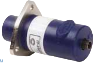
IT-250FM Smart Coil™

Flange Mount Coil Primary Resistance: 0.83 – 1.02 ohms Secondary Resistance: 6.2 – 7.6k ohms Max. Output: 45kV Duration: 400-500 uS