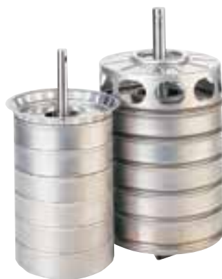
REPLACEMENT STACKS AND REPAIR KITS

Available for immediate delivery and installation, saving on unnecessary downtime.