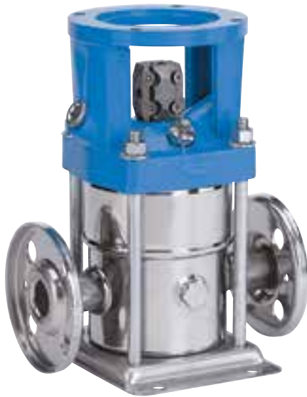
MODEL BVM & BVMK -304SS AND 316 SS

With a diversified line of products and accessories to choose from, you can easily customize the pump that's right for you.