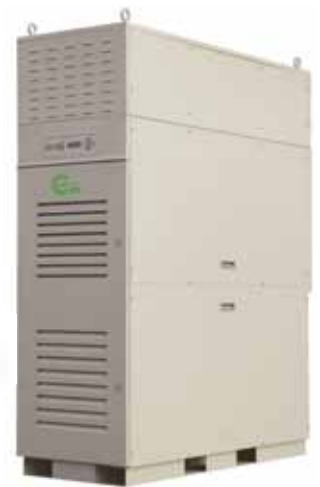
C65 ICHP MicroTurbine