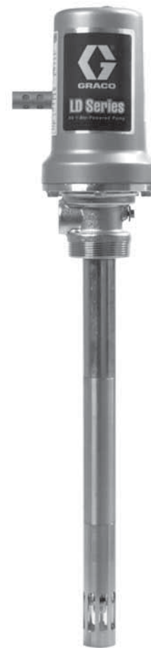
LD Series 50:1 Pump