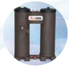
Oil Water Separators