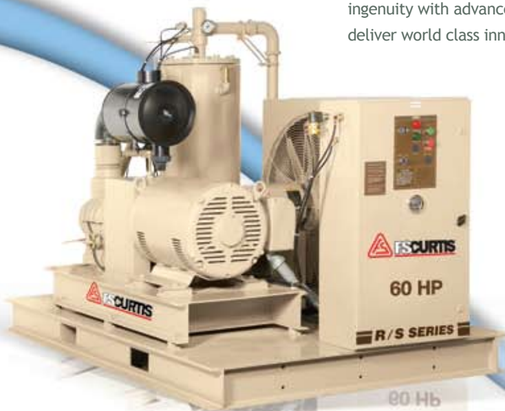
RS Series 60HP Compressor

Engineers have pushed their colleagues through collaboration to create pyramids and columns that have stood the test of time. Since 1854, CURTIS has engineered the longest lasting, best-built line of industrial air compressors Today, the FSCURTIS RS Series compressor honors that heritage by combining creative ingenuity with advanced engineering to deliver world class innovation and value.