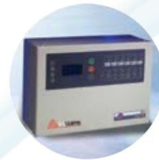
FSCURTIS Energy Management Systems