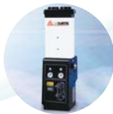
Desiccant Air Dryers Dew Points to -100° F