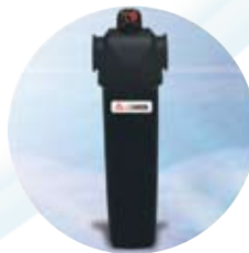
Filters— Particulate and Coalescing