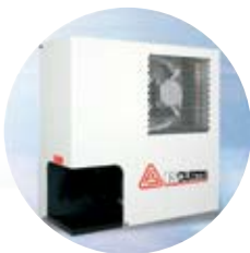
Refrigerated Air Dryers Dew Points to +38° F

KEEP YOUR COMPLETE AIR SYSTEM RUNNING AT PEAK EFFICIENCY