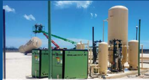
Fabricated System on Location