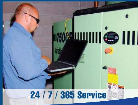
24 / 7 / 365 Service

Thinking “ My Compressed Air System runs so why worry? ” means you’re likely wasting up to 50% or more in energy costs. To maintain and improve peak system performance and cut operating costs, it’s essential to analyze the system’s supply and demand sides, evaluate components, and regularly maintain the system. That’s Pumps & Service’s ‘Total System Performance’ approach.